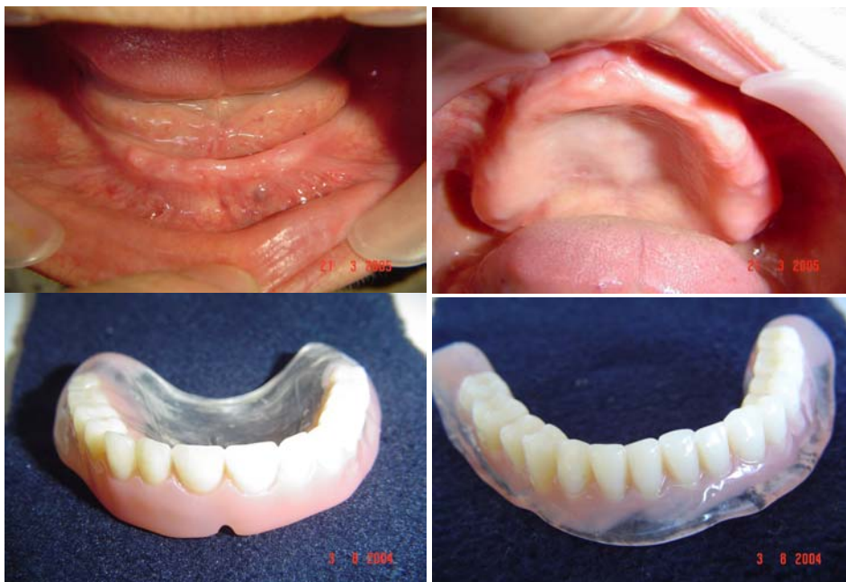
Fig. 6. Maxillary and mandibullary prosthetic fields. Final complete removable dentures.