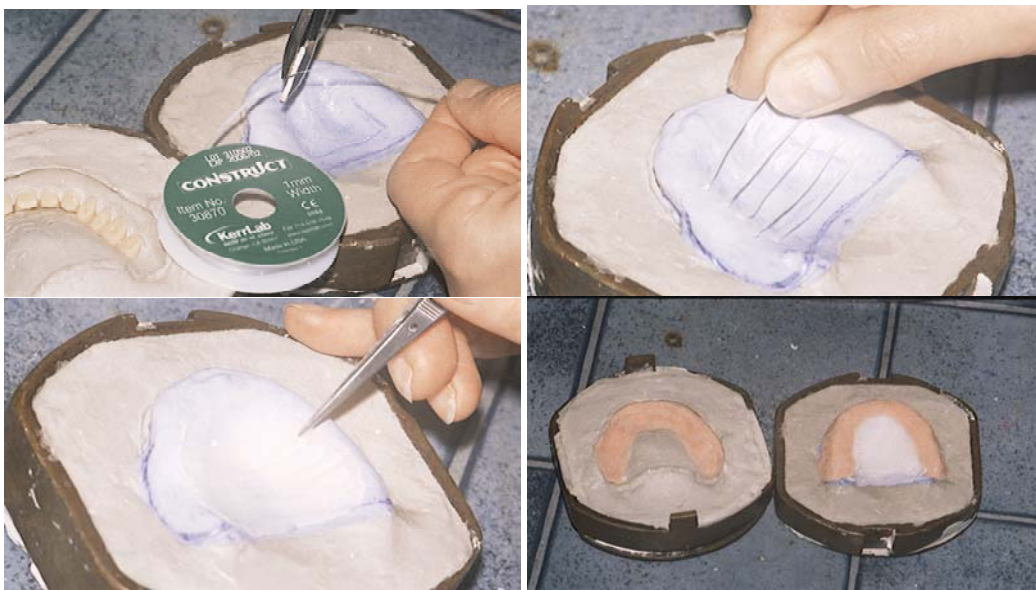
Fig. 2. The insertion of polyethylene fibres – technological aspects.