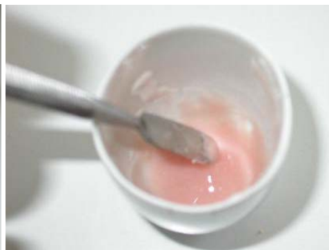
Fig. 5. The preparation of the modified acrylate.