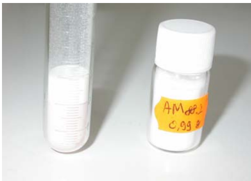
Fig. 4. The AM88 component.