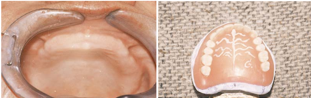
Fig. 1. Maxillary prosthetic field. The model of the complete removable denture.

The association of the classic acrylate with the copolymer leads to the amelioration of the oral candidosis approximately after two weeks (Fig. 6).